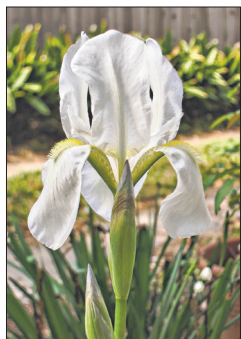
A white flag blooms.

And at some point, they made it to my husband's grandparents' farm near Mansfield. That's where we got them, the only heirloom plants we have from his side of the family.