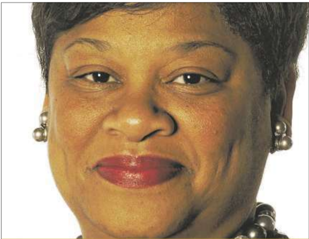
pittre WALKER |homeless programs